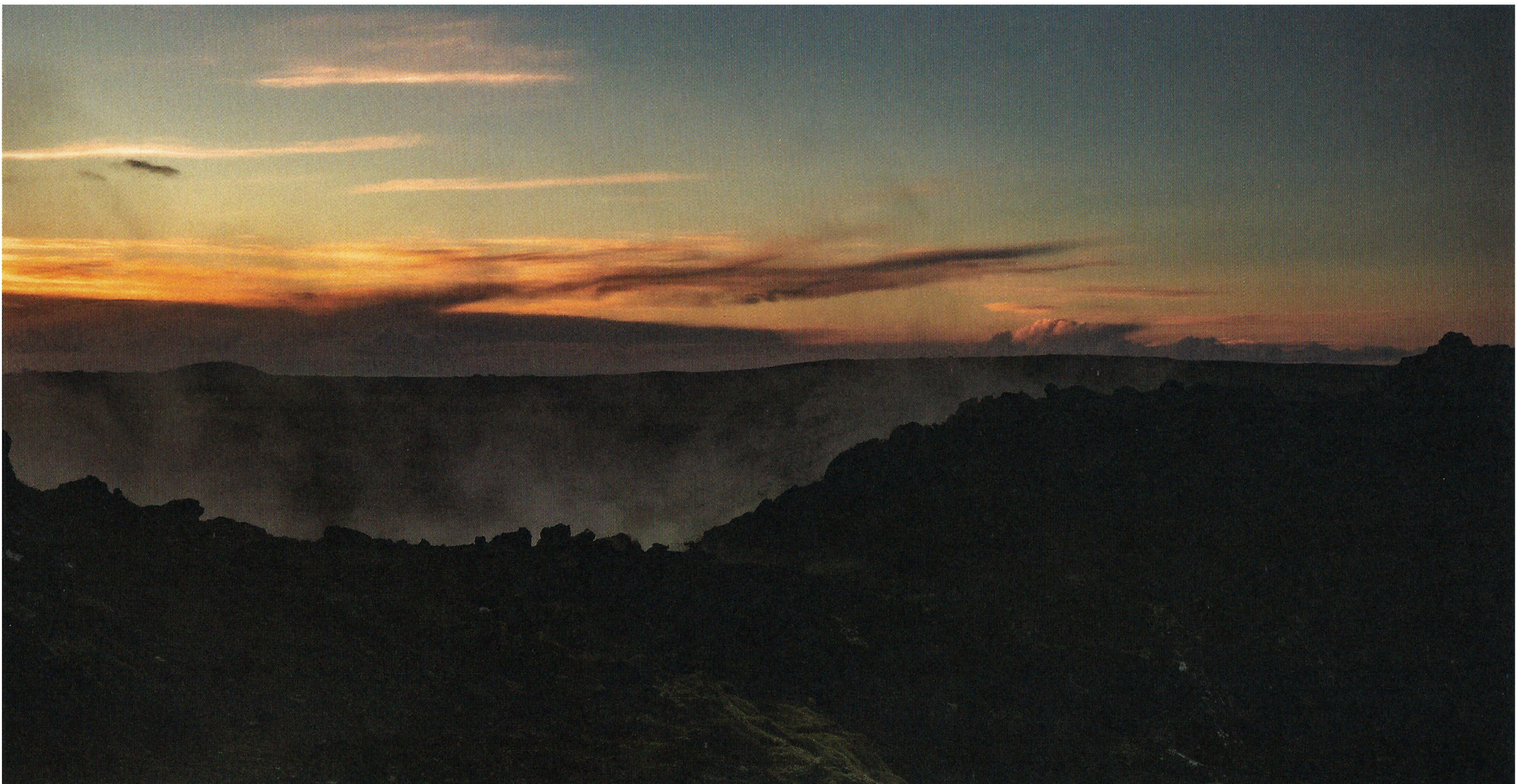
M Site//11.3.85/ (The Crater) November 2001